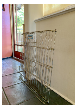
3 panels collapsed