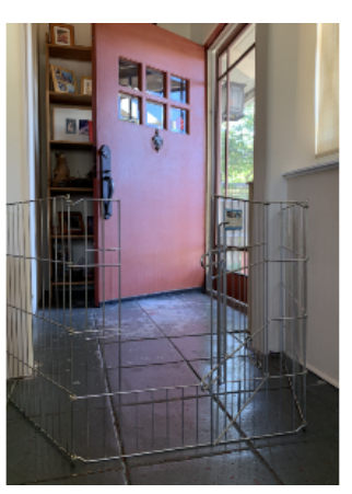
3 panels gate open