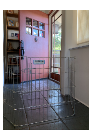
3 panels gate closed